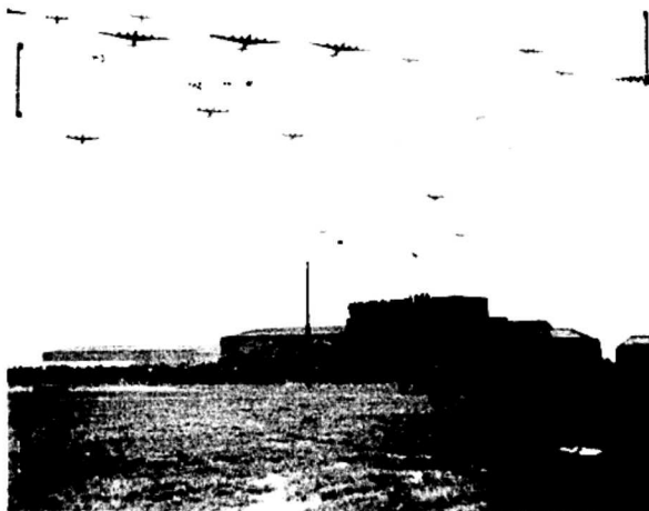
300th A/C return from 300th mission in an awe-inspiring display of perfect formation. Col. Sutton's plane can be seen in the upper left central part of picture.